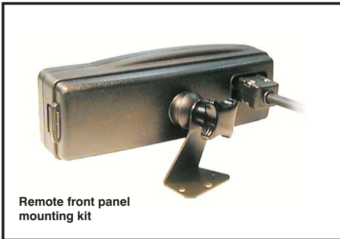
Remote front panel mounting kit

Improved audio quality according to PESQ (Perceptual Evaluation of Speech Quality, ITU-T recommendation P.862).