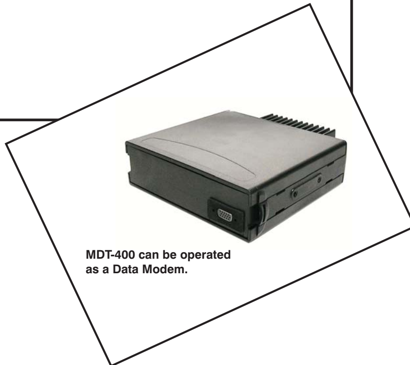
MDT-400 can be operated as a Data Modem.